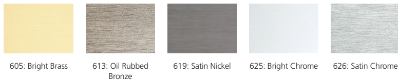
605: Bright Brass 613: Oil Rubbed Bronze 619: Satin Nickel 625: Bright Chrome 626: Satin Chrome