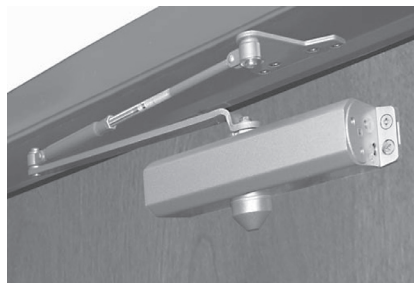
Standard Parallel Arm