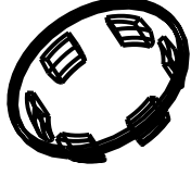
STRIKE HOLE PLUG