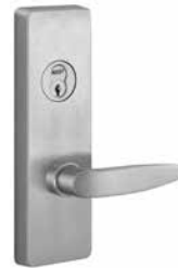
4900B "B" Lever