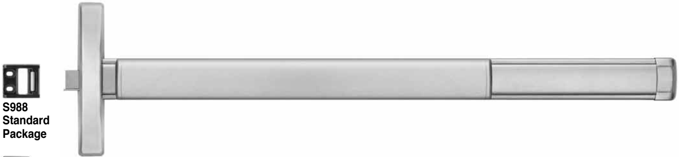
S988 Standard Package S458 Optional for Hollow Metal Door or Mullion applications