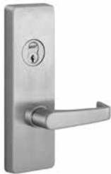
4900A "A" Lever