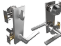
Shown with Tempo Lever