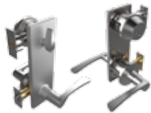
Shown with Ridge Lever