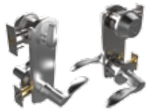
Shown with Echo Lever