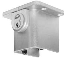
Key Removable Mullion Cap KMC822 (Rim Cylinder required)