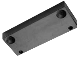
Mullion Cap Spacer MCS822