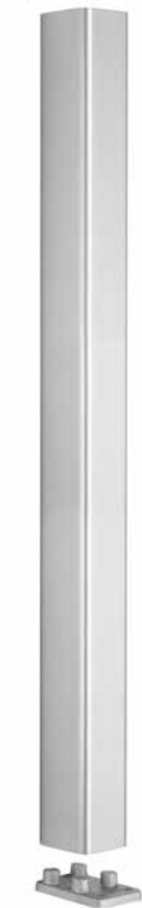
Mullion Base MB811